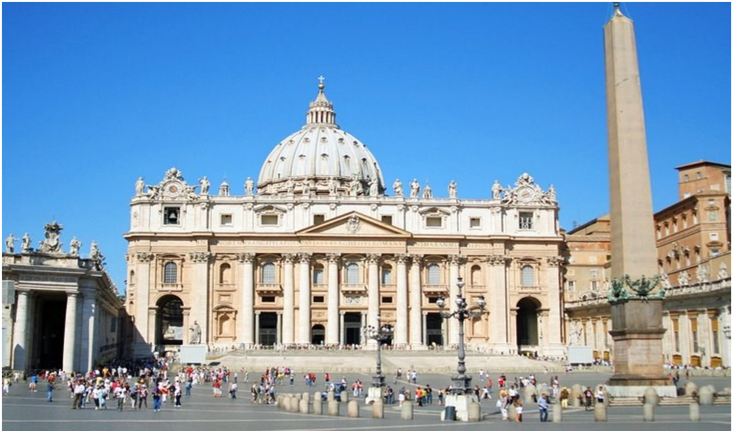
St Peter's Basilica - Vatican

Rome, Venice, San Giovanni Rotondo (St Padre Pio), Assisi ( St Francis/ St Claire / Blessed Carlo Acutis), Cascia (St Rita), Corato ( Blessed Luisa Picarretta), Padua ( St Anthony), Naples , Island of Capri