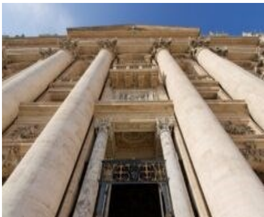
The Holy Door